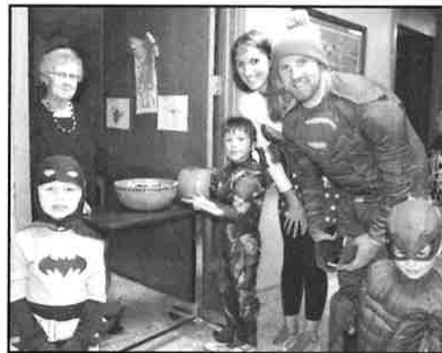
Trick or treating fun at The Highlands and St. Luke Lutheran Home.