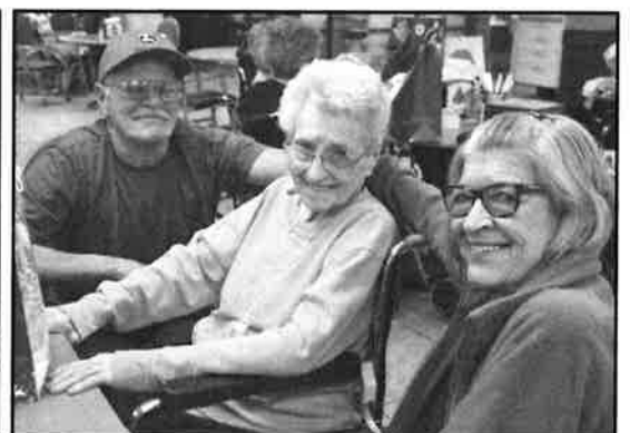
St. Luke Lutheran Home's Christmas party.