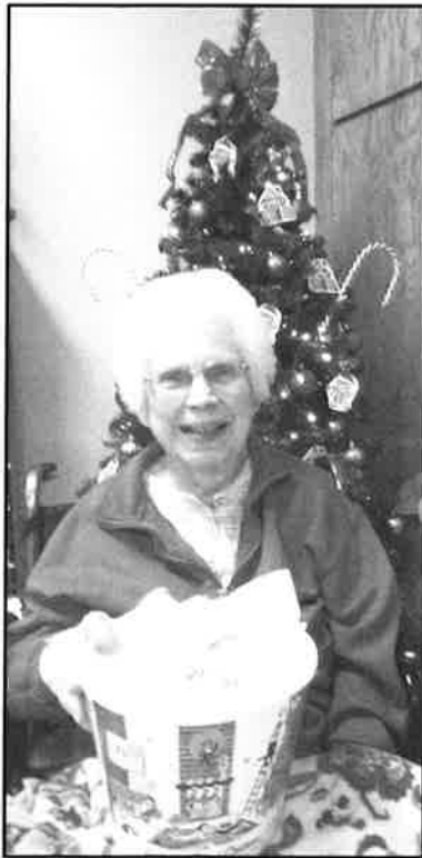
This St. Luke Lutheran Home "Make A Wish" program recipient enjoyed her favorite meal of KFC with a couple of her friends. Make A Wish wishes, such as this one, are granted in part courtesy of St. Luke Homes & Services' Benevolent Fund and participating individuals, organizations and businesses.