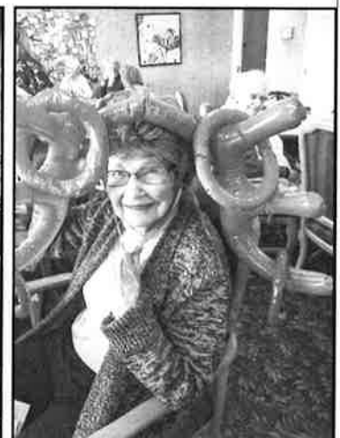
Painting Christmas ornaments, making gingerbread houses, and playing reindeer antler ring toss at Riverview Terrace Assisted Living.