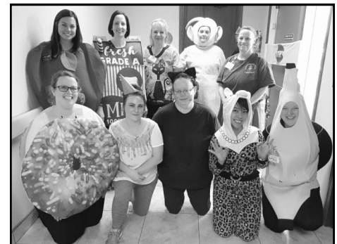
St. Luke Lutheran Home Dietary Staff