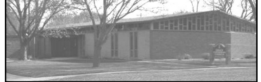
Grace Lutheran Church 380 N. Rerick Avenue, Primghar (712) 957-4795