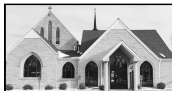
St. Paul's Lutheran Church 60 N. Central Avenue, Hartley (712) 728-2711 www.stpaullutheranhartley.com/