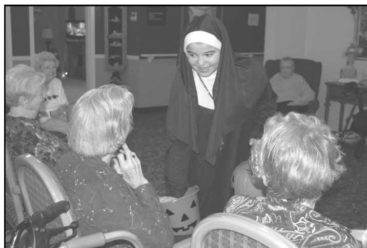
Hillside Terrace Assisted Living tenants