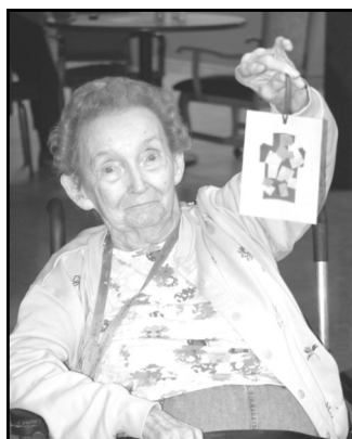
First English Christian Preschool students (at right), spread joy in early March while entertaining tenants of the Hillside & Riverview Terrace Assisted Living residences and residents of St. Luke Lutheran Home.