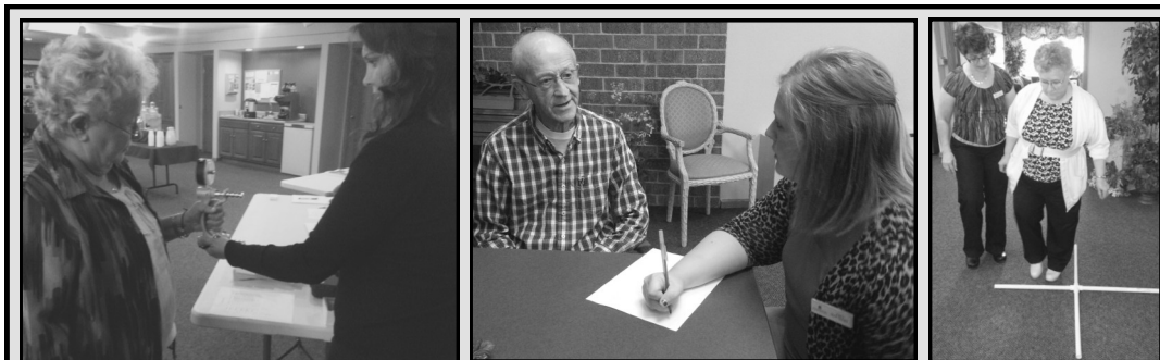
Therapists from Millennium Therapy, based on the St. Luke Homes & Services, Inc. campus, conducted free strength, balance, vision and memory screenings Sept. 23 at The Highlands in honor of the first day of fall and the sixth annual National Falls Prevention Awareness Day.