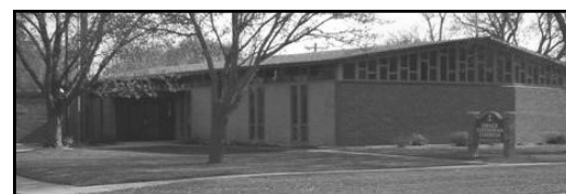
Grace Lutheran Church 380 N. Rerick Avenue, Primghar (712) 957-4795